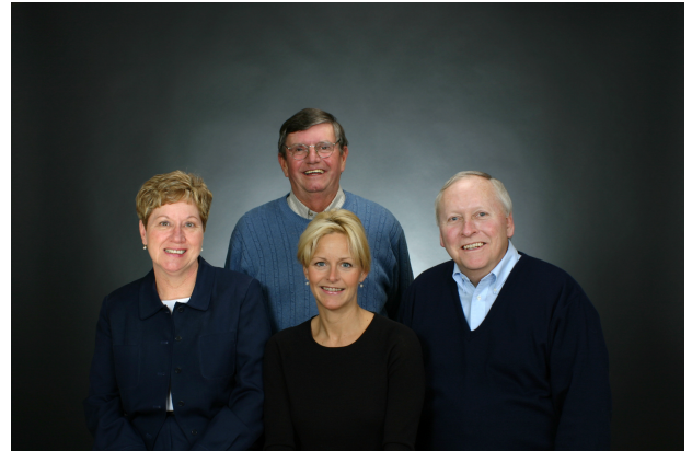
The Oceanside Realty Team

Now that these two issues have been resolved, the Beach Committee and the Town of Eastham will return to the Commission for a final recommendation of the project.